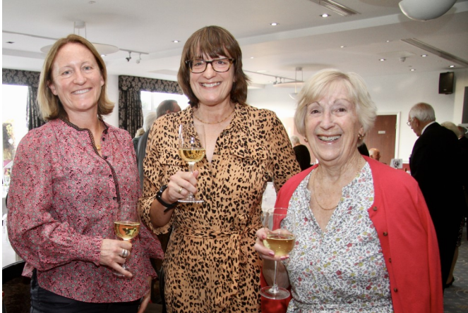
< Lady members attended for the first time